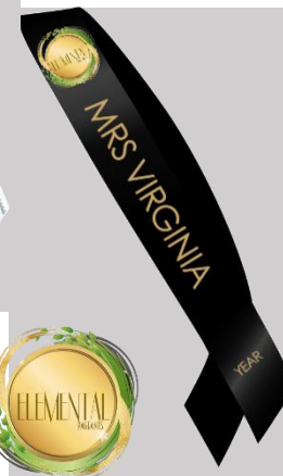
STATE Black Service Sashes